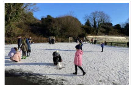
Snow Day at St Johns