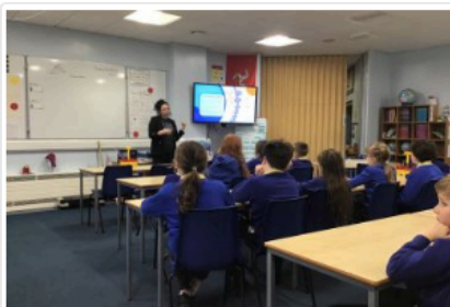
What can we do about Climate Change?